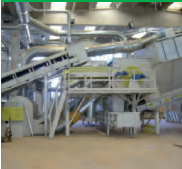
AIR SEPARATOR FOR LIGHT FRACTION