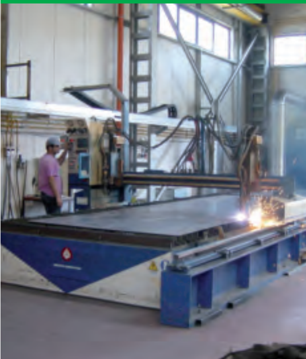
CNC OXYGEN CUTTING PLANT