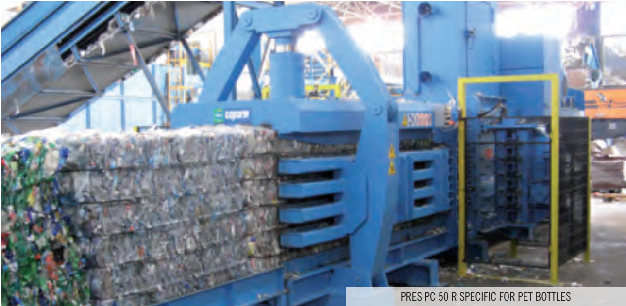
PRES PC 50 R SPECIFIC FOR PET BOTTLES