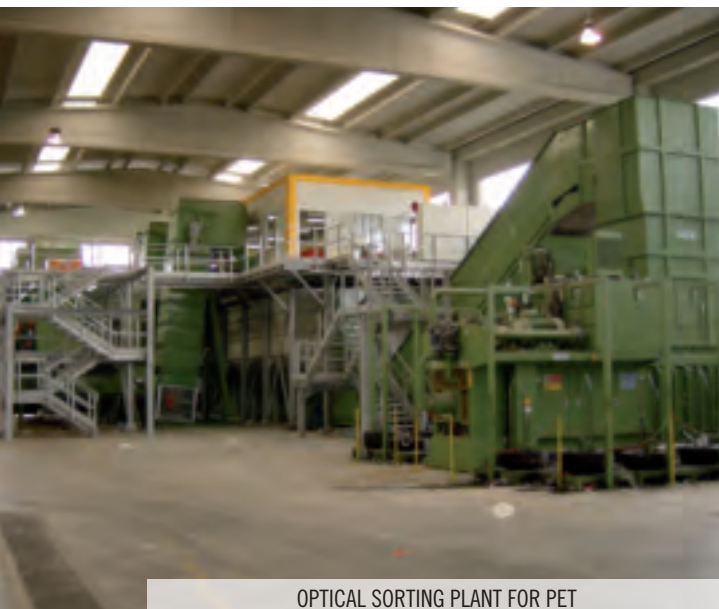
OPTICAL SORTING PLANT FOR PET