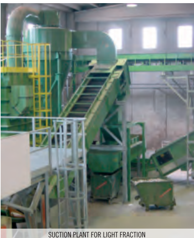
SUCTION PLANT FOR LIGHT FRACTION