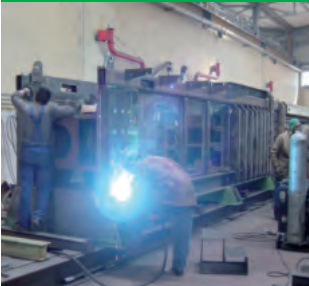
PRESS PR 225